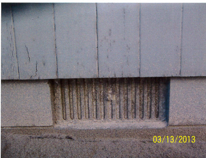
Vent View – Date of Photograph: (See Photo Stamp)