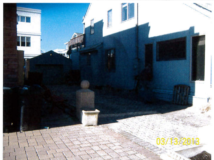
Left Side View – Date of Photograph: (See Photo Stamp)